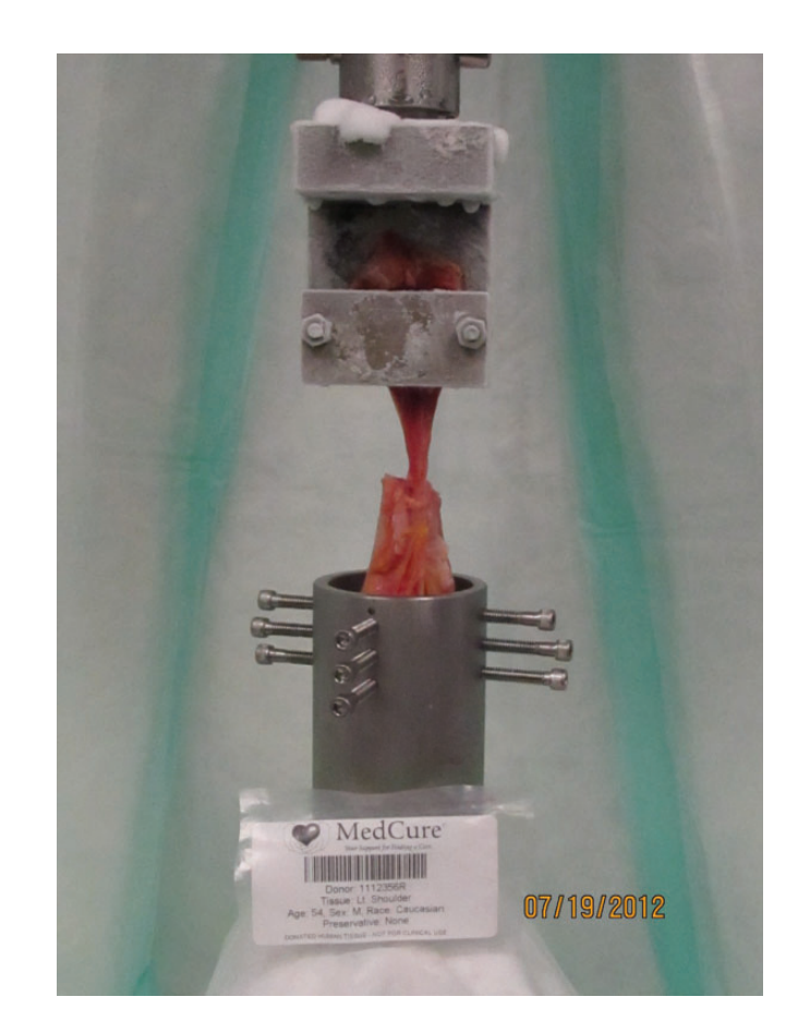
Figure 2. Fixture used for biomechanical evaluation.

After approval by the institutional review board, the medical records of 49 patients (51 shoulders) who underwent arthroscopic biceps tenodesis performed by the senior surgeon between May 2009 and February 2012 were identified